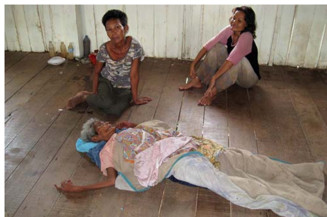
'An elderly woman lay comatose on the floor, [at Koh Koh detention centre] unable to move or to talk, with flies and ants crawling over her face. She reportedly had not eaten for two weeks. Fellow detainees said that she had been sick since she was brought to Koh Ko from Prey Speu center where she had been as long as one year, they said The center's staff said they had not previously sent the woman to hospital 12 because of lack of money.