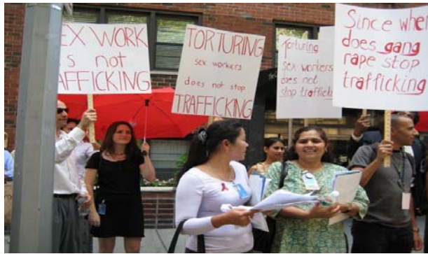
A demonstration at the Cambodian Consulate in New York.

Fundamental human rights violations. It is fortunate that Licadho established that the human rights violations were in fact occurring as alleged. The photographs taken during their visits to detention centres, some of which appear in this article, ended the myth that women are taught skills for new employment or were in any way protected in custody. Admittedly the Ministry of Interior rejected the Licadho report in October without any coherent explanation but this was probably to be expected from the department responsible for those abuses. Nevertheless condemnation of unlawful detention, rape and beatings associated with the law is widespread and even extends to many of agencies that champion abolition of sex work as the best way to combat exploitation and trafficking. (e.g. the Asia Foundation, UNDP and UNICEF, USAID, The Ministry Of Women’s Affairs). Although one would not say that sex workers are not at risk of being raped, beaten and illegally detained in Cambodia, there are indications that the storm created around them has set up a degree of political sensitivity that will be protective to some extent. In my experience in other countries police deny abuse, stop or reduce it and say ‘what abuse were you talking about’. While this is frustrating for activists the outcome is at least some improvement.