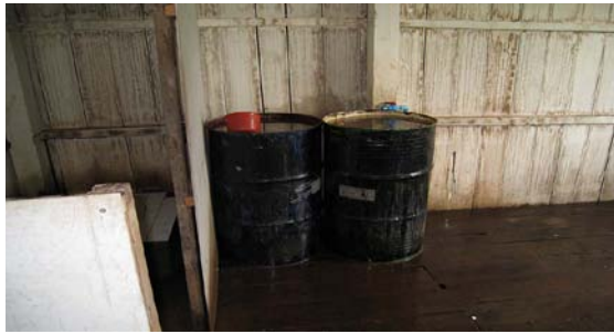
There are several toilets in the room, with only partial privacy provided by a low wall, and two drums of water for washing. Asked about drinking water, center staff said there was water from the river