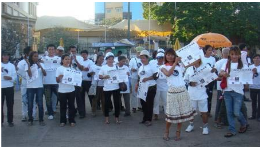
Sex workers protest against MTV NO EXIT concert

The second strategy has been to make the eradication of sex work a centrepiece of US foreign assistance on AIDS. The creating legislation for the US President's Emergency Plan for AIDS Relief (PEPFAR), a multi-billion dollar initiative launched in 2003, explicitly states that it is the United States' policy to "eradicate prostitution and other sexual exploitation." The Act prohibits governments and organizations receiving US government funds from activities that "promote or advocate legalization or practice of prostitution and sex trafficking." A second clause - known as the "pledge requirement" - requires all recipients of US government funds to "have a policy explicitly opposing prostitution and sex trafficking". With these billions on hand from PEPFAR and anti-trafficking funding, the Bush administration's ability to damage the cause of sex workers' rights - and, more broadly, to recast the terms of the global AIDS response - has been many magnitudes greater than it would have been otherwise. The US right-wing's assault on women's reproductive rights was never anywhere so well financed" 60